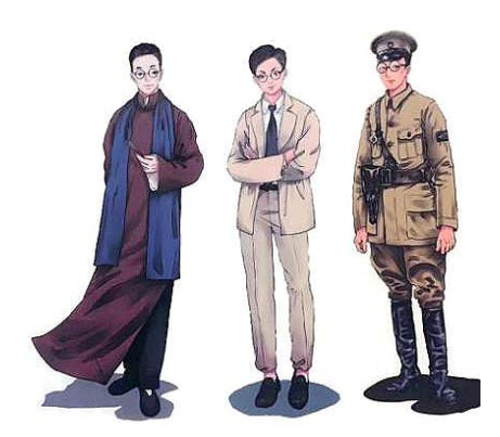
Fig.2 Comics and Derivative Pictures by Creative Students

Changzhou has famous celebrities since ancient time, such as Liu Haisu, Li Boyuan, Tang Jingchuan, Shi Liang, Liu Guojun, Qu Qiubai and so on. After having the subject selection, the plastic art of its animation image becomes very important. The popular animation products inevitably require the familiar cultural stories with the people. For example, Changzhou Canal red culture of the great memorial-Qu Qiubai, Zhang Tailei, Yun Daiying are carried on the animated character image by animation professional students. With distinctive artistic features, the comics, school bags, water cups, commemorative medals and other series of cultural products have been subsequently developed (Figure 2). The market promotion of animated images with distinctive plastic art images can improve the audience interest, and it provides a broader space for the consequent development of its derivatives, thus realizing the promotion of the value and influence for Changzhou Grand Canal red cultural products.